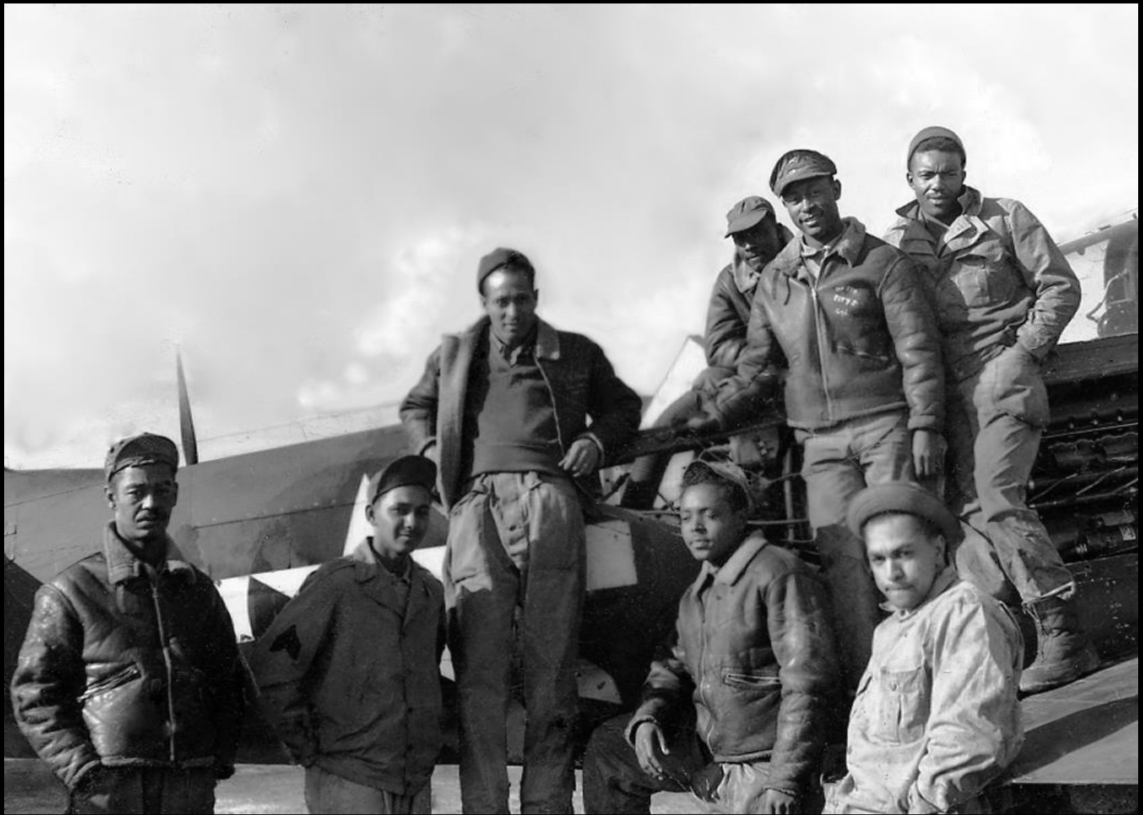
Enlisted men with P-39 at Selfridge Field MI. 1943