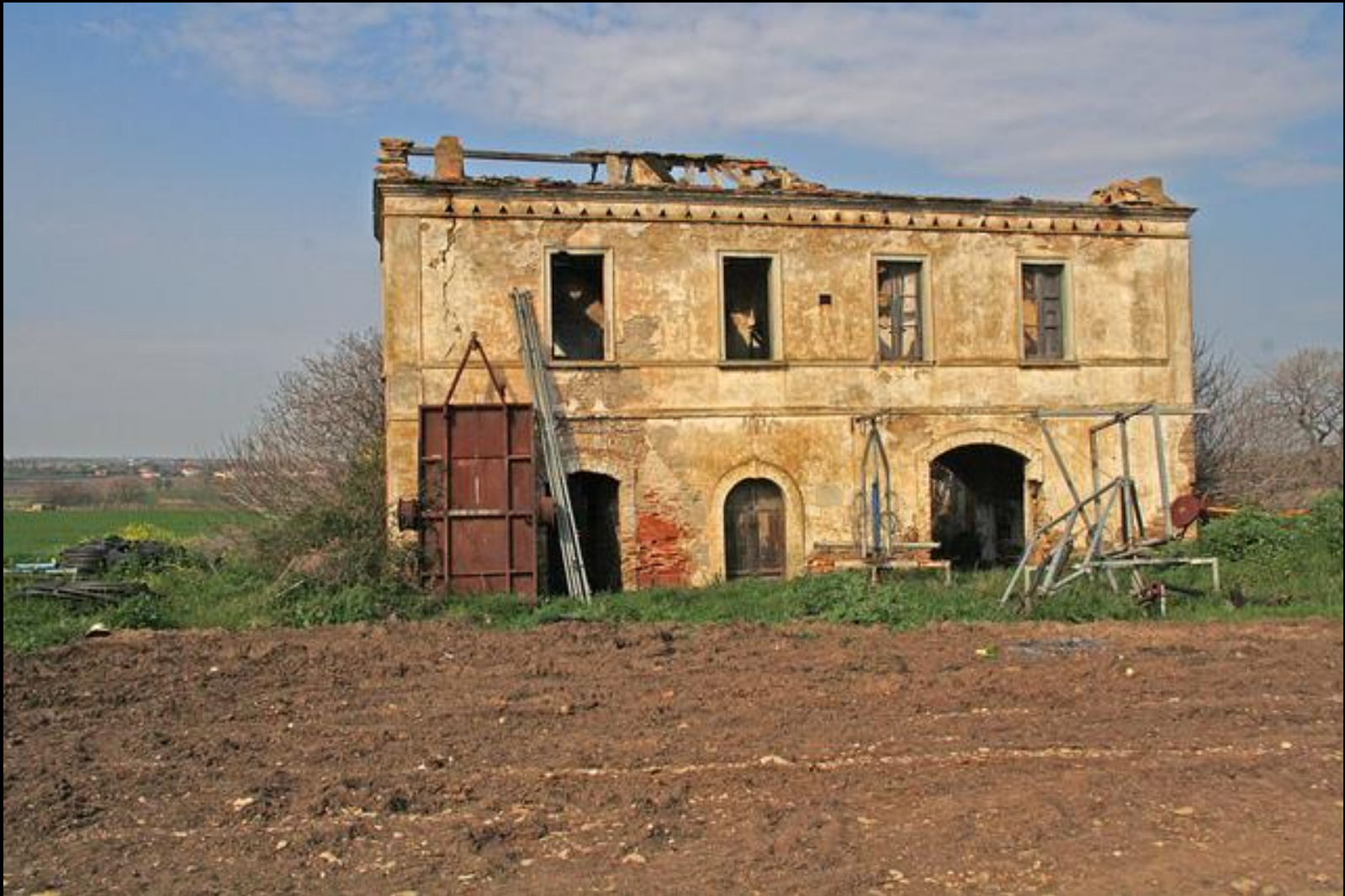
The former Ramitelli operations and briefing room in 2012