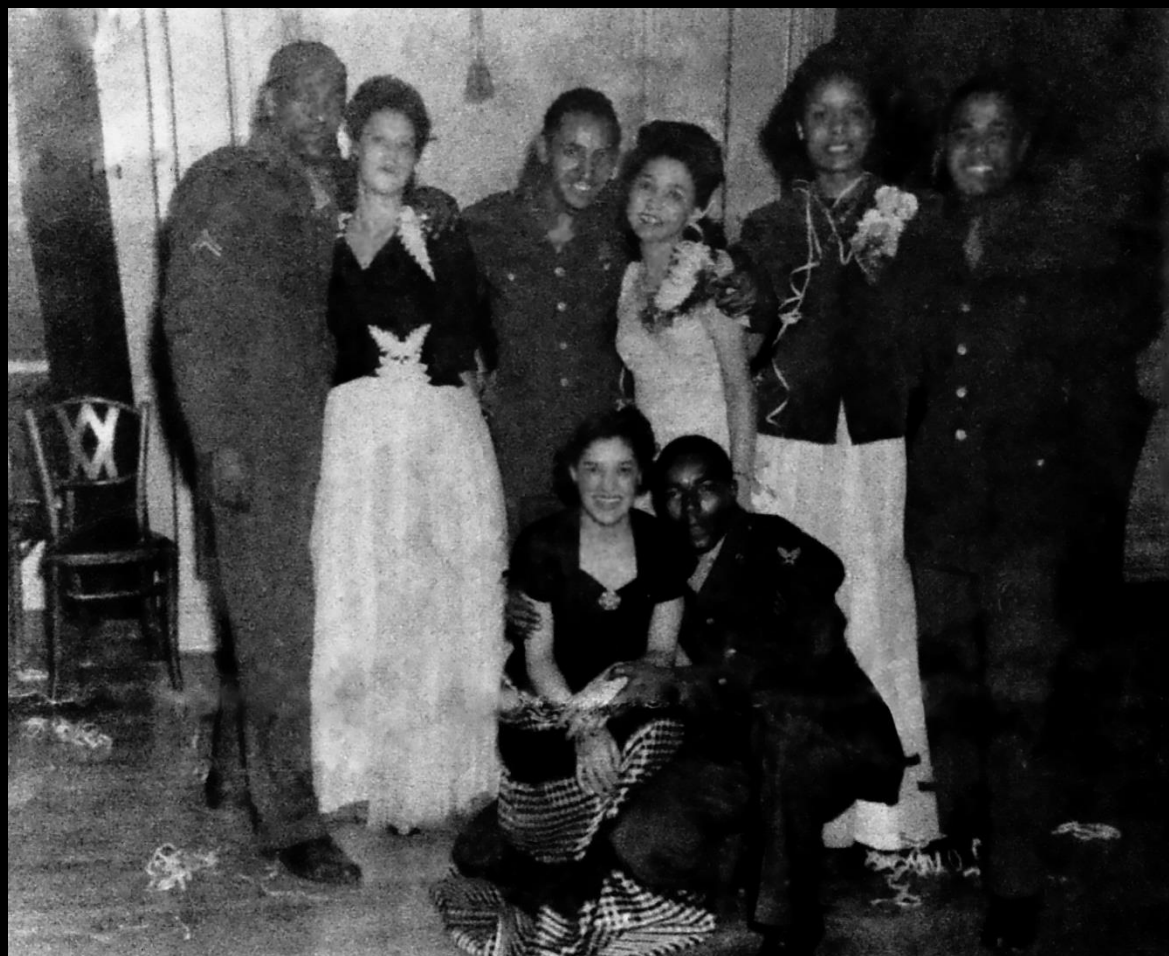
Grandpa Before Grandma. Ha ha!