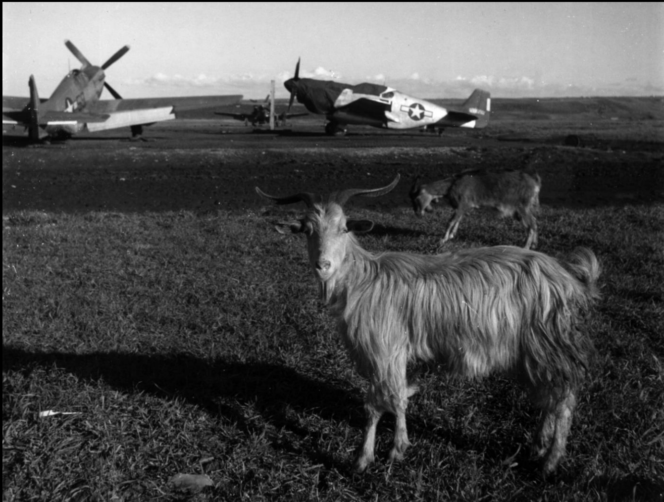
Clearing The Field at Ramitelli, Italy P-51C Mustangs at Ramitelli Airfield