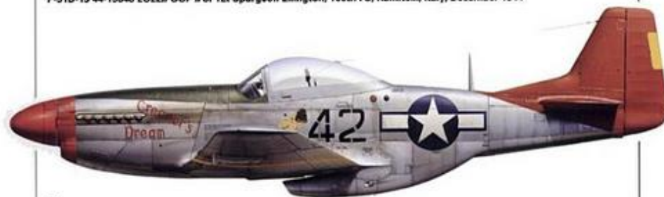
24 P-51D (serial unknown) Cremer's Dream of 1Lt Charles White, 301st FS, Ramitelli, Italy, January 1945