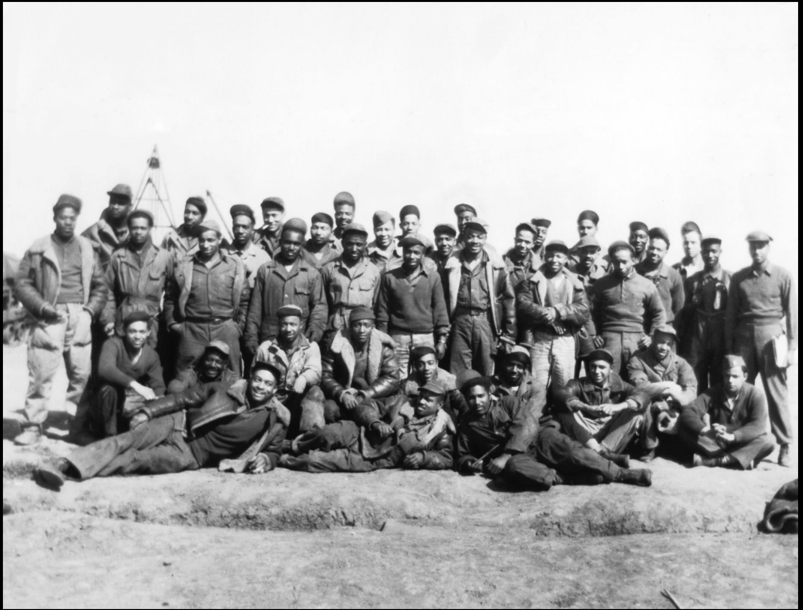
100th FS Ground Crew