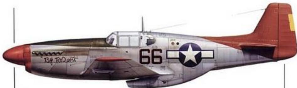
21 P-51C (serial unknown) By Request of Col Benjamin O Davis, CO of the 332nd FG, Ramitelli, Italy, December 1944