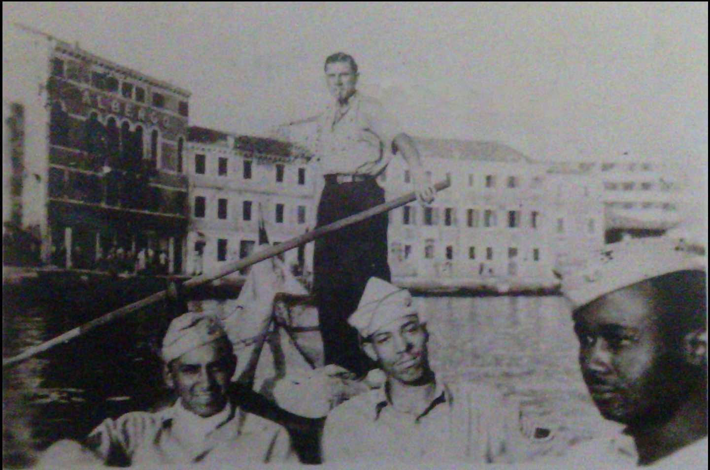
CPT in Italy